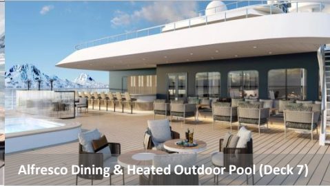
Alfresco Dining & Heated Outdoor Pool (Deck 7)